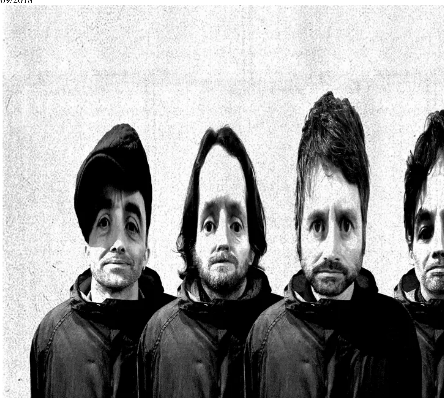
Roedd y clwb yn rhan allweddol o feithrin talent Cymreig fel y Super Furry Animals. A project showcasing Newport's rock and indie music will celebrate the city's legendary music history thanks to £58,400 of National Lottery funding.

A brand new exhibition featuring animations and memorabilia will be created by young women and girls at Newport Museum and will feature recordings of real life stories and memories, focusing on the South Wales city's music scene in the 70s, 80s and 90s.