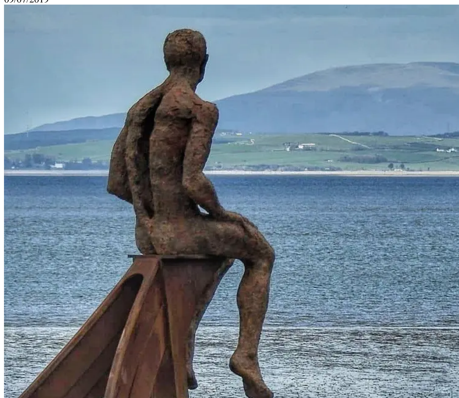
As the incredible Luminary art installation opens at the National Lottery-funded Crossness Pumping Station, we spoke to four artists who combine old and new in their work.