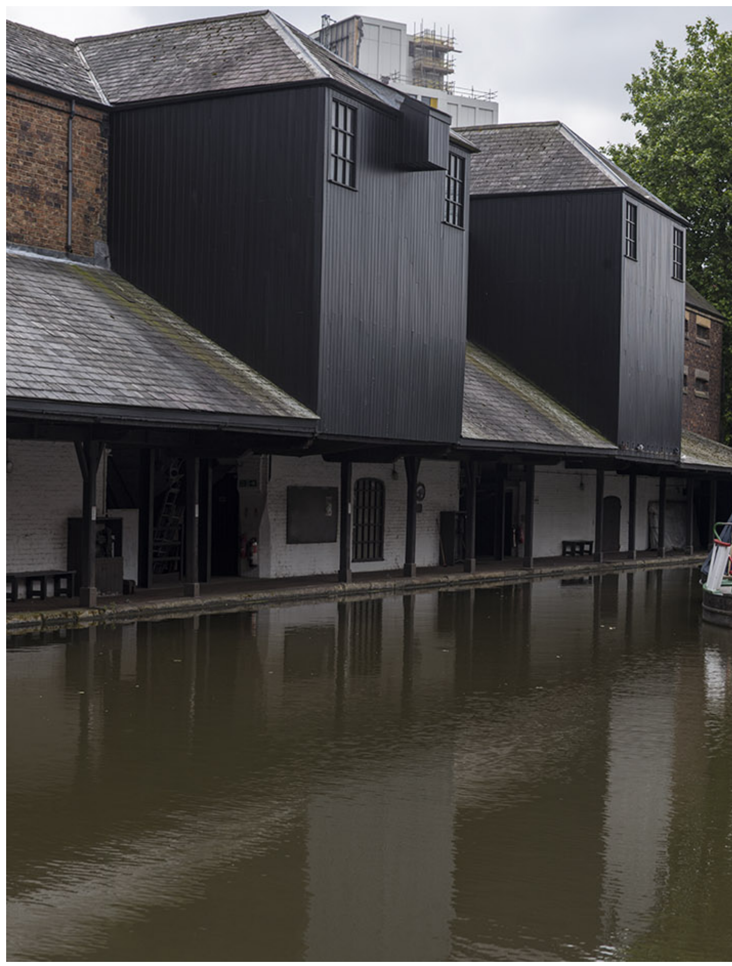
Coventry canal.