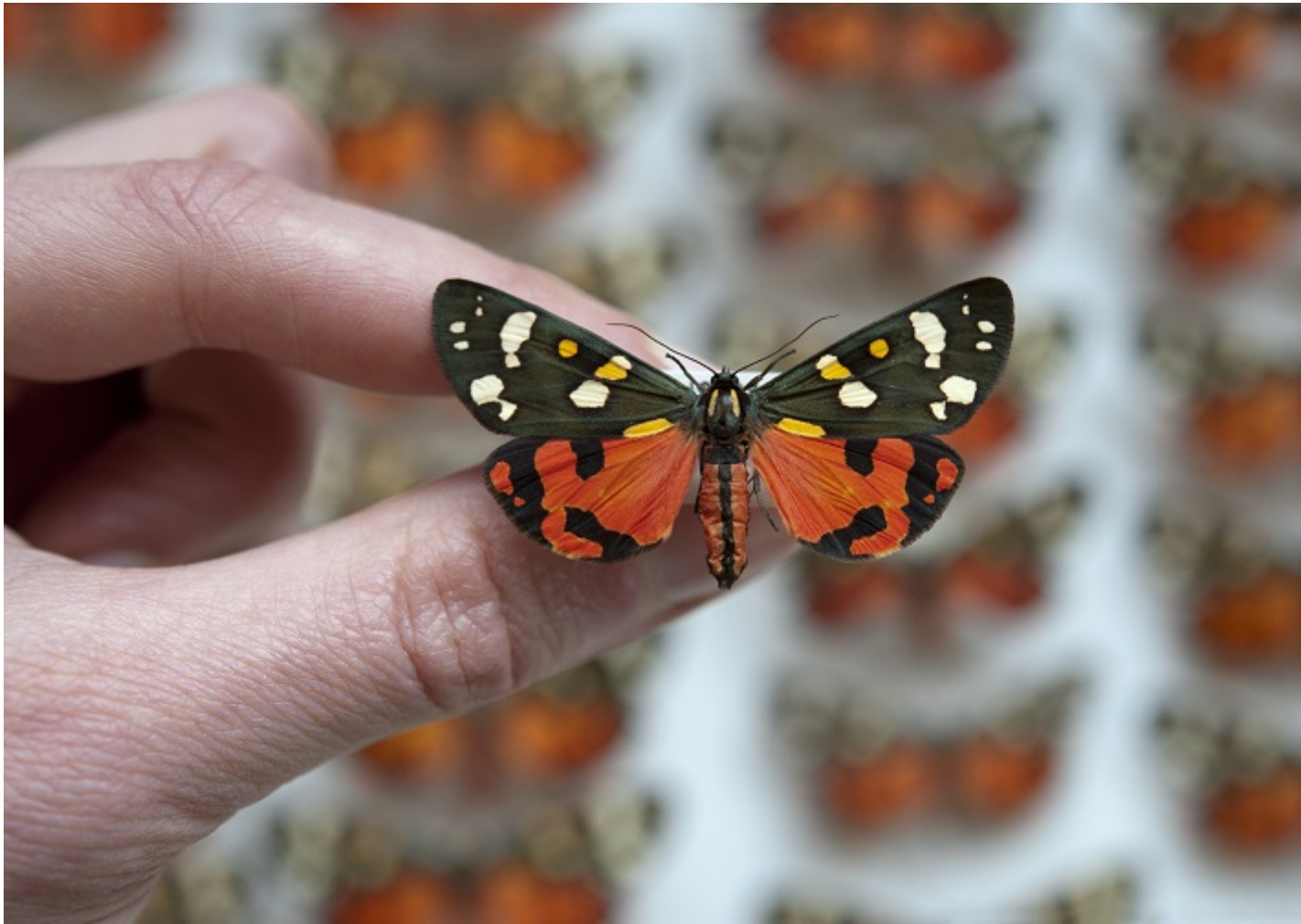
Callimorpha (scarlet tiger moth).

Home to seven million objects, including the world's first scientifically described dinosaur and the only soft tissue remains of the extinct dodo, the museum's latest National Lottery funding will safeguard its collection of one million insects .