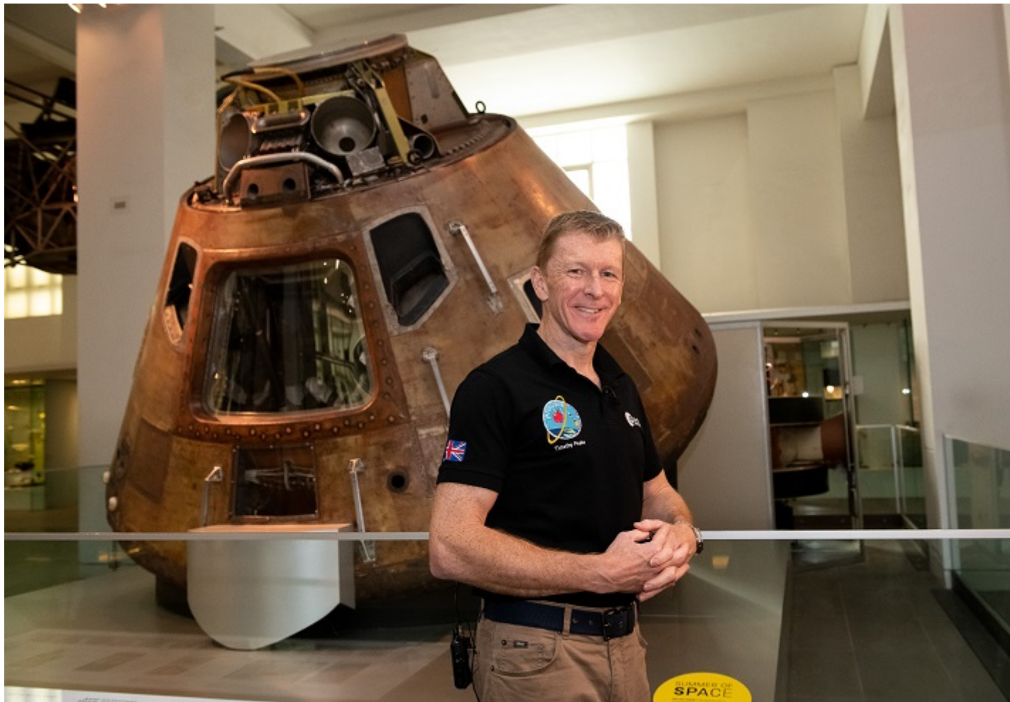
Major Tim Peake with the Apollo 10 command module.

"Jodrell Bank is also particularly special to me, since the inspiration for my career path was born by simply looking up to the stars and being intensely curious about what the universe was all about. Jodrell gives us that innate connection to our origins and how we came to be here."