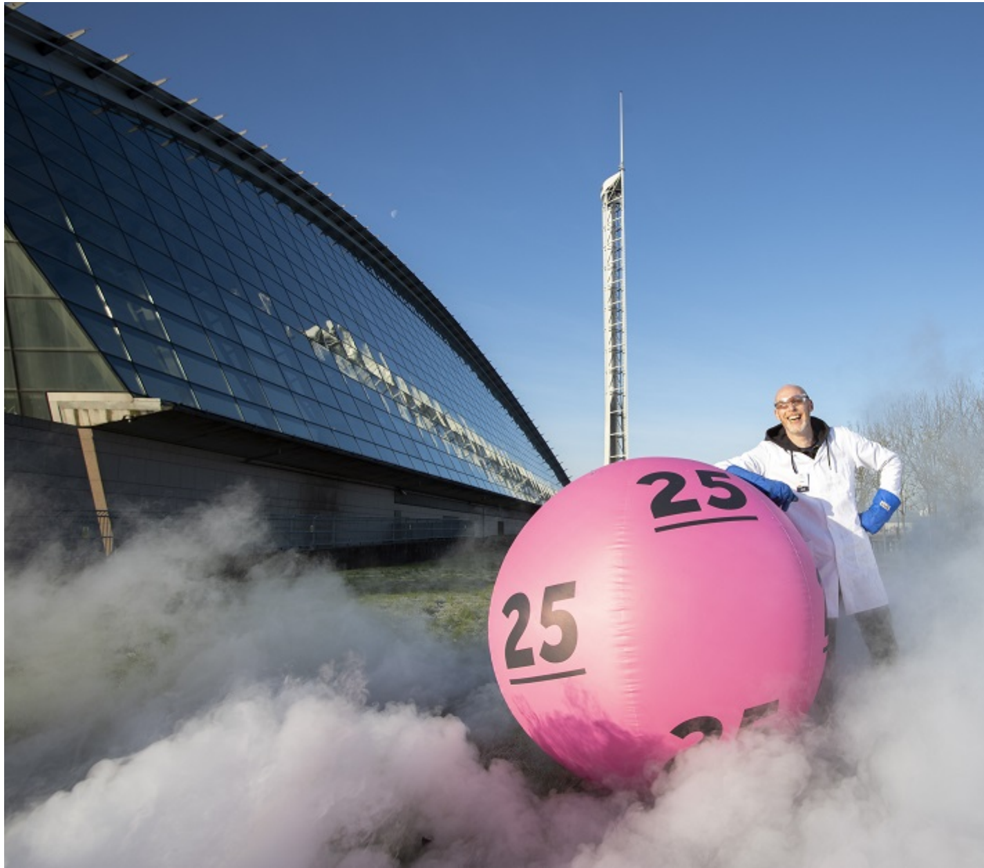
Glasgow Science Centre receives a flamboyant visitor in 2019

Hundreds of interactive exhibits bring science and technology to life at one of Scotland's most popular attractions, which opened thanks to £36m from The National Lottery.