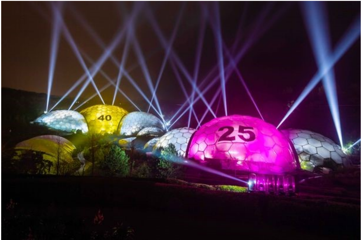
The Eden Project celebrates 25 years of The National Lottery

The Eden Project's massive biomes house the largest rainforest in captivity and year-round events, exhibitions and concerts. It would not have been possible without £56m from The National Lottery.