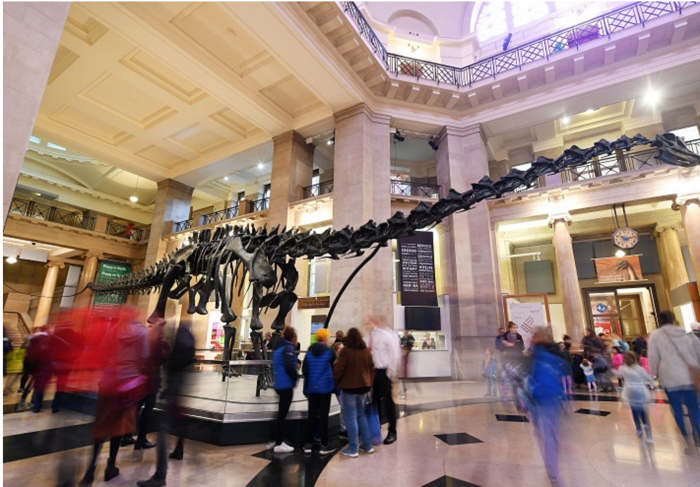
Dippy on tour

Housing world-class art , natural history and geology collections, National Museum Cardiff has benefited from major National Lottery support over the past 25 years. The museum is also Dippy the Diplodocus' current stop on his National Lottery-funded tour!