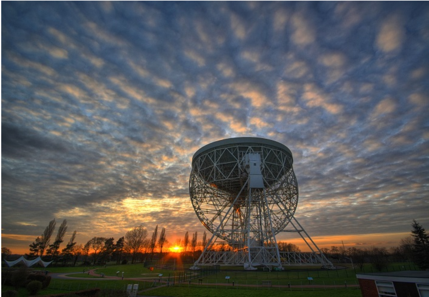
The striking Jodrell Bank.

With one of the most powerful radio telescopes in the world, Jodrell Bank offers visitors the opportunity to explore the wonders of the universe. The National Lottery-funded First Light Project will reveal some incredible stories and feats of engineering in a new gallery and interpretation space opening in 2021.