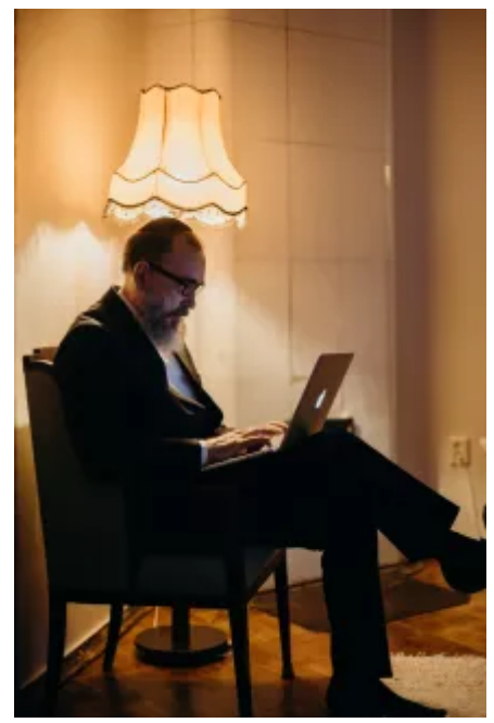
Help us support digital skills in heritage