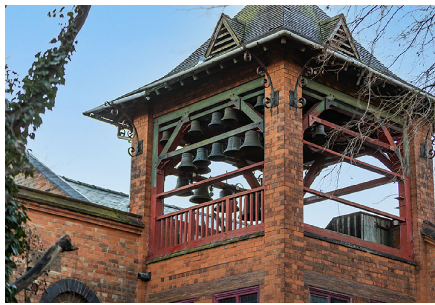
The carillon tower at Loughborough's.