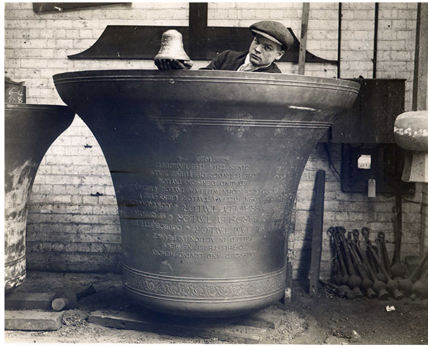
Large carillon bell created at the foundry, which has been producing bells since 1859

"This will ensure that the foundry, its buildings, the museum and rare archive will be protected, and that Loughborough bells are heard and enjoyed by many future generations."