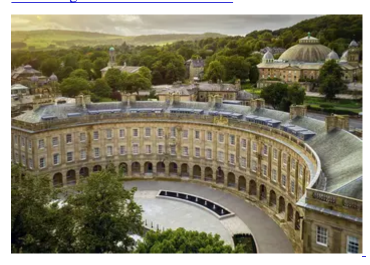
Buxton Crescent