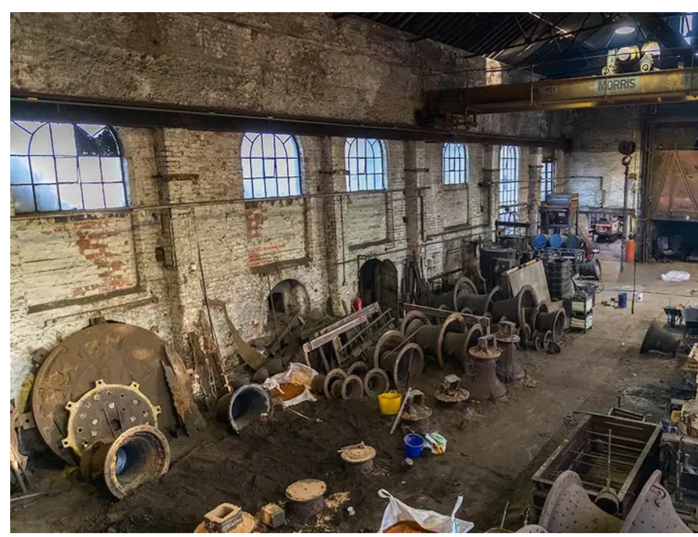
Inside of the foundry

The foundry employs a team of 30 who have a range of highly specialist heritage skills, including bell casting and tuning. It produces all associated parts such as hanging frames, wheels and ropes.