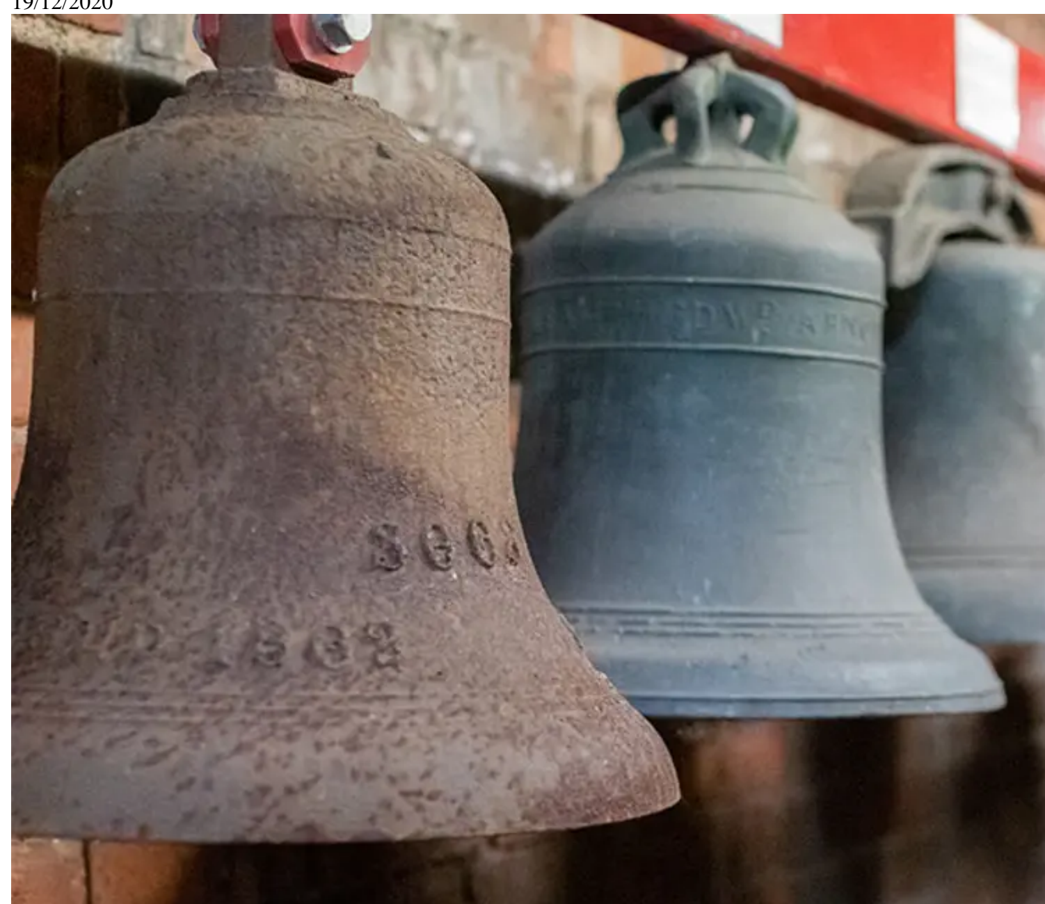
The restoration of Loughborough Bellfoundry, thanks to £3.45million National Lottery funding, means the bells can continue to ring out for years to come.