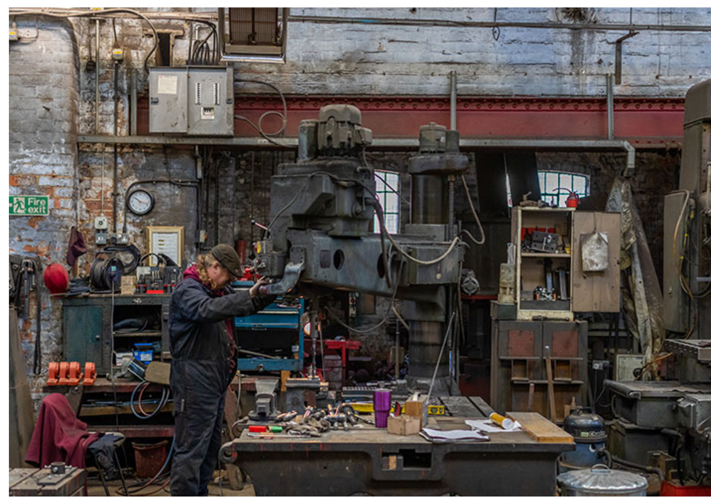
One of Loughborough Bellfoundry's high-skilled bell makers at work.