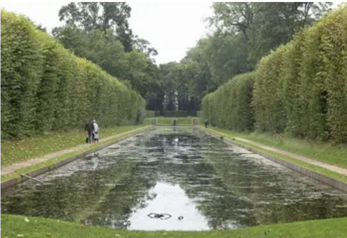
ry of Northern Ireland