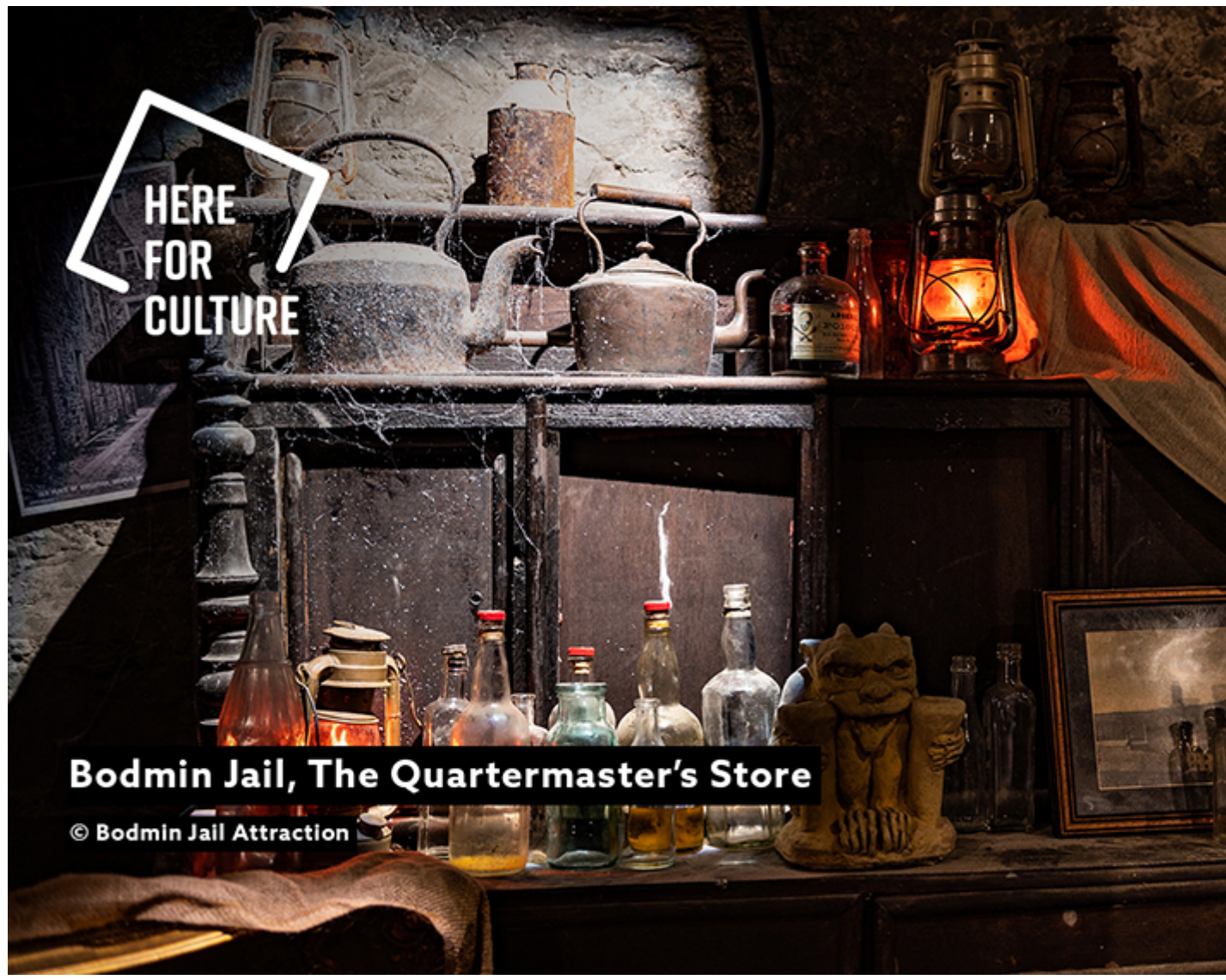
Bodmin Jail is the perfect setting for intimate meetings.