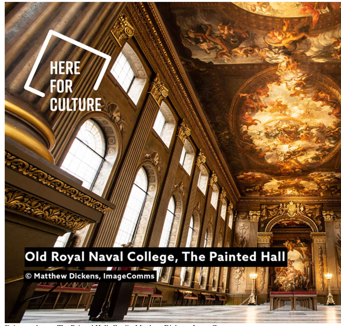
Epic grandeur at The Painted Hall.

You can now choose to meet in the drawing room where Elizabeth Gaskell took tea with luminaries such as Charles Dickens and Charlotte Bronte, or you can enjoy London's oldest botanic garden, Chelsea Physic Garden, without leaving the comfort of your home.