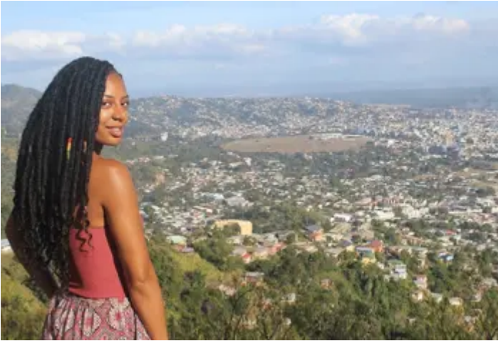
Exploring Trinidad and Tobago's natural heritage at Fort George, Port of Spain.