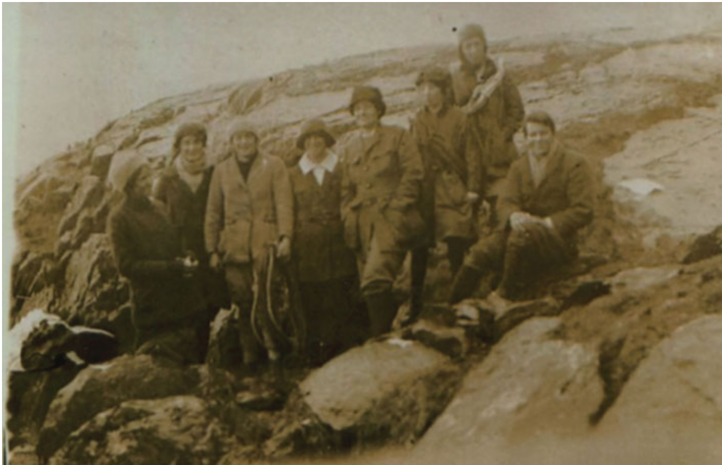
The Pinnacle Club's first meeting in 1921

Climbing provides an opportunity to get close to nature, and has incredible mental wellbeing and physical health benefits. The club hopes the series of blogs will inspire people of all backgrounds and ages, particularly women, to see how climbing can offer escapism from their everyday lives and build a stronger connection with our natural heritage.