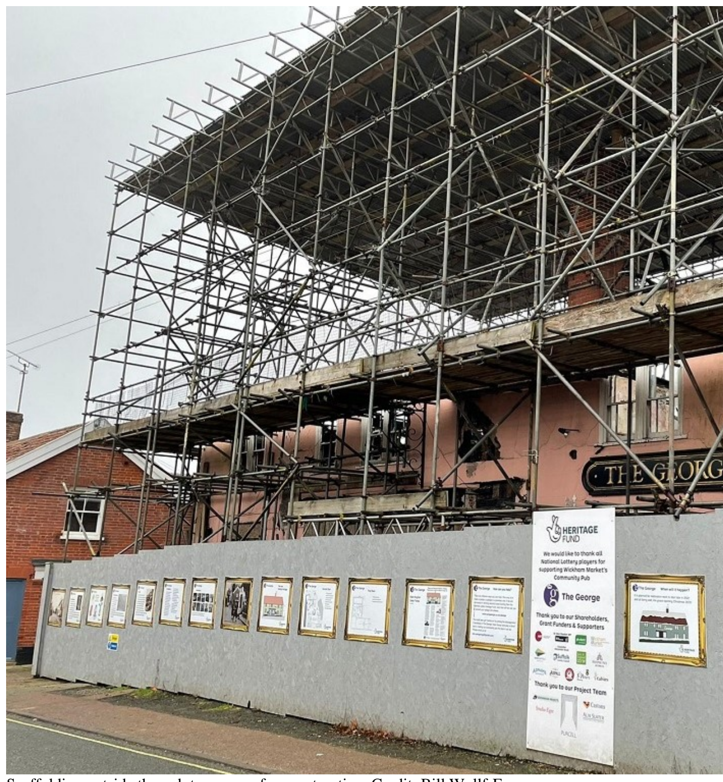
Scaffolding outside the pub to prepare for construction.

Alongside this, a programme of wellbeing activities will be developed in association with Wellbeing Suffolk and local community groups. Programmes in development include support for people living with dementia or loneliness, ensuring they will have a safe, inclusive place in which to meet and socialise in a post-lockdown world.