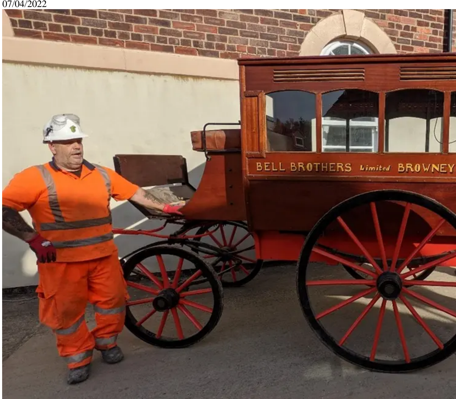
Cleveland Ironstone Mining Museum in North Yorkshire to be renamed Land of Iron when it reopens in autumn 2022.

The new name better reflects the visitor experience following the museum's £2.3million revamp.