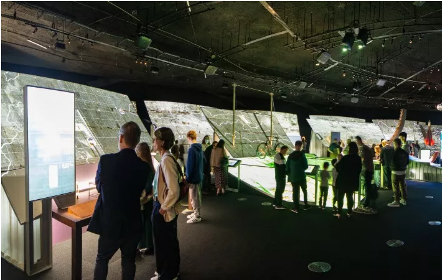
The First Light Exhibition at Jodrell Bank.

They will be able to experience the thrill of a meteor shower, crawl into a black hole, and even try 'driving' a radio telescope.