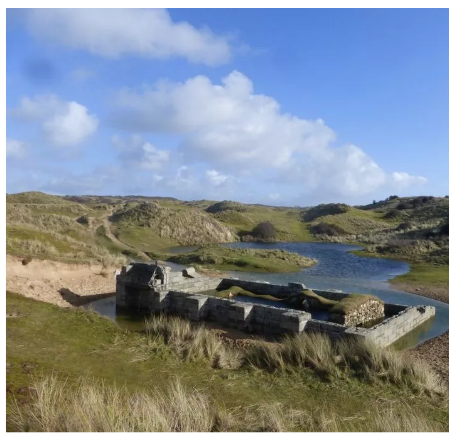
St Piran's Oratory at Penhale Sands in Perranporth flooded.

The site is currently on Historic England's Heritage at Risk Register due to the risk of flooding and erosion.