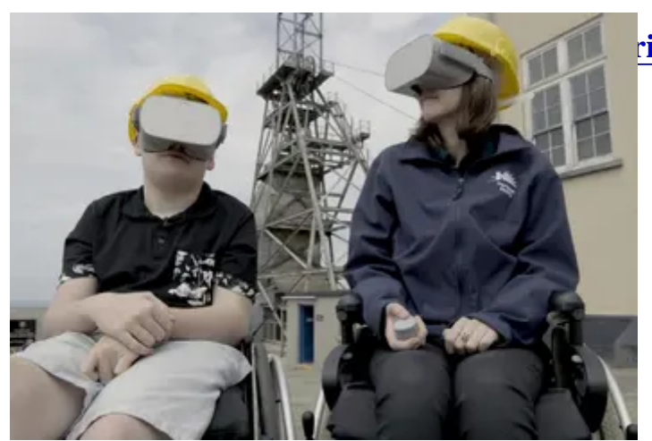
ries of Cornwall