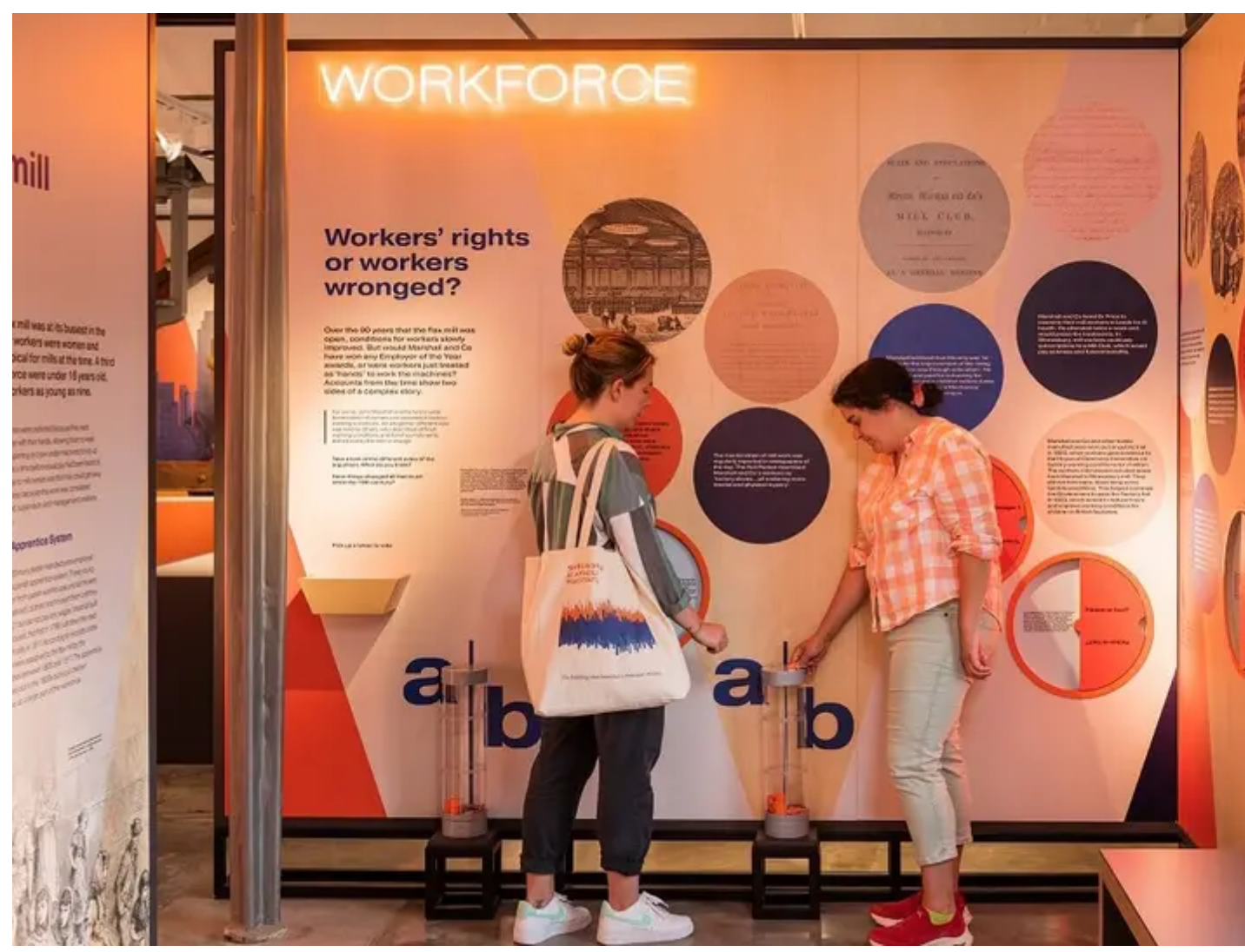
The new exhibition 'The Mill'.