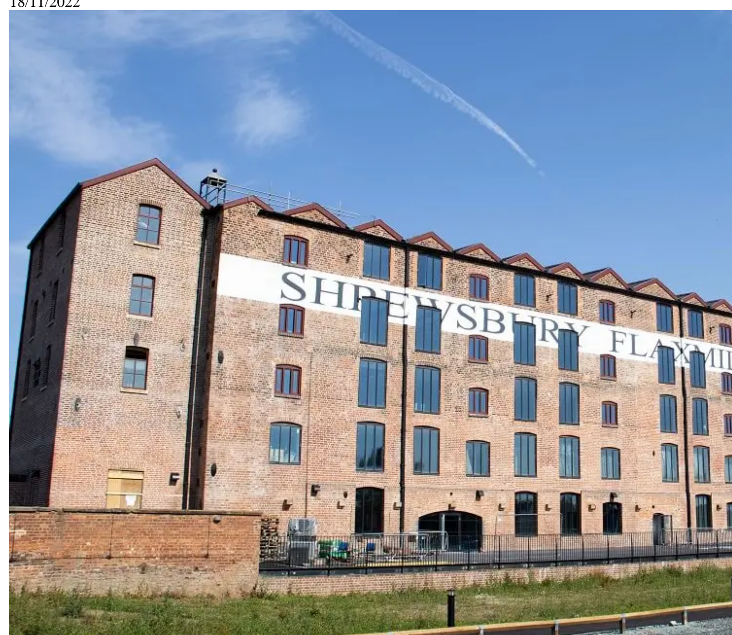
The historic Shrewsbury Flaxmill Maltings - the 'grandparent of skyscrapers' - has opened its doors again following 35 years of closure thanks to £20.7million National Lottery funding.

Four listed buildings on site are now fully restored: the Smithy, Stables, Main Mill and Kiln. Their redevelopment has been led by Historic England and The Friends of Shrewsbury Flaxmill.