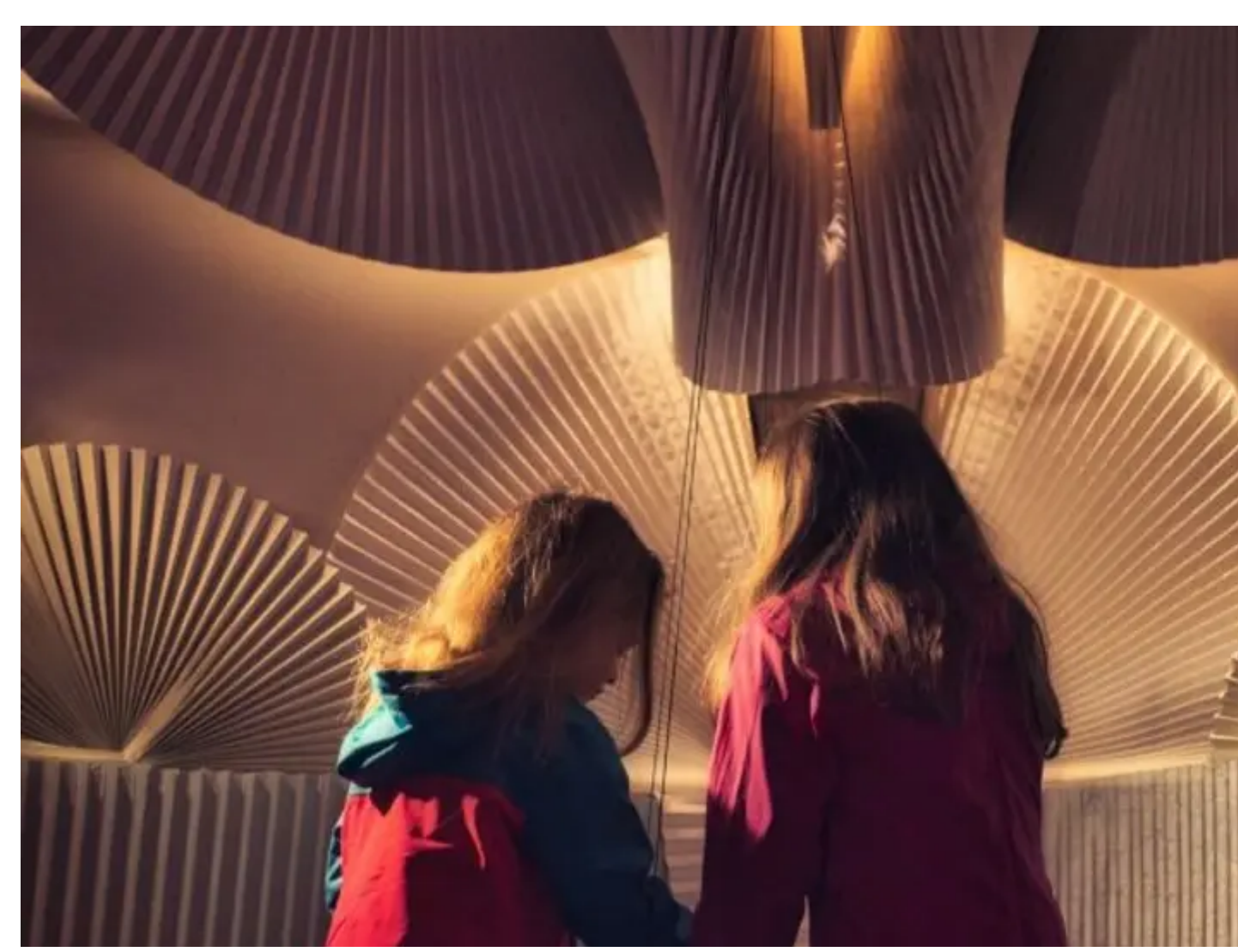
The sand pendulum exhibit's backdrop is made from window blinds arranged into decorative shapes and patterns.

"It feels good to make use of things and it can be a wonderfully creative process to deconstruct used objects into functional parts, shapes and patterns and to see the potential and beauty in unwanted things. I really enjoyed taking old window blinds, embracing their imperfection and playing with their patterns to make the backdrop for the sand pendulum exhibit."