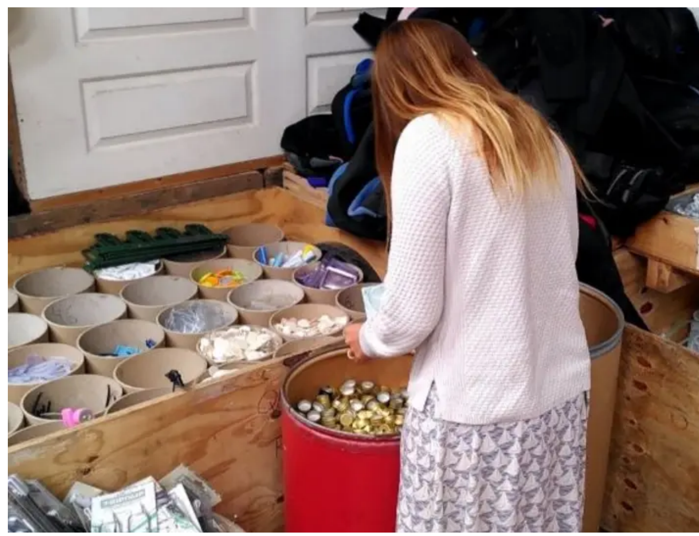
Using waste materials found in a scrap store.