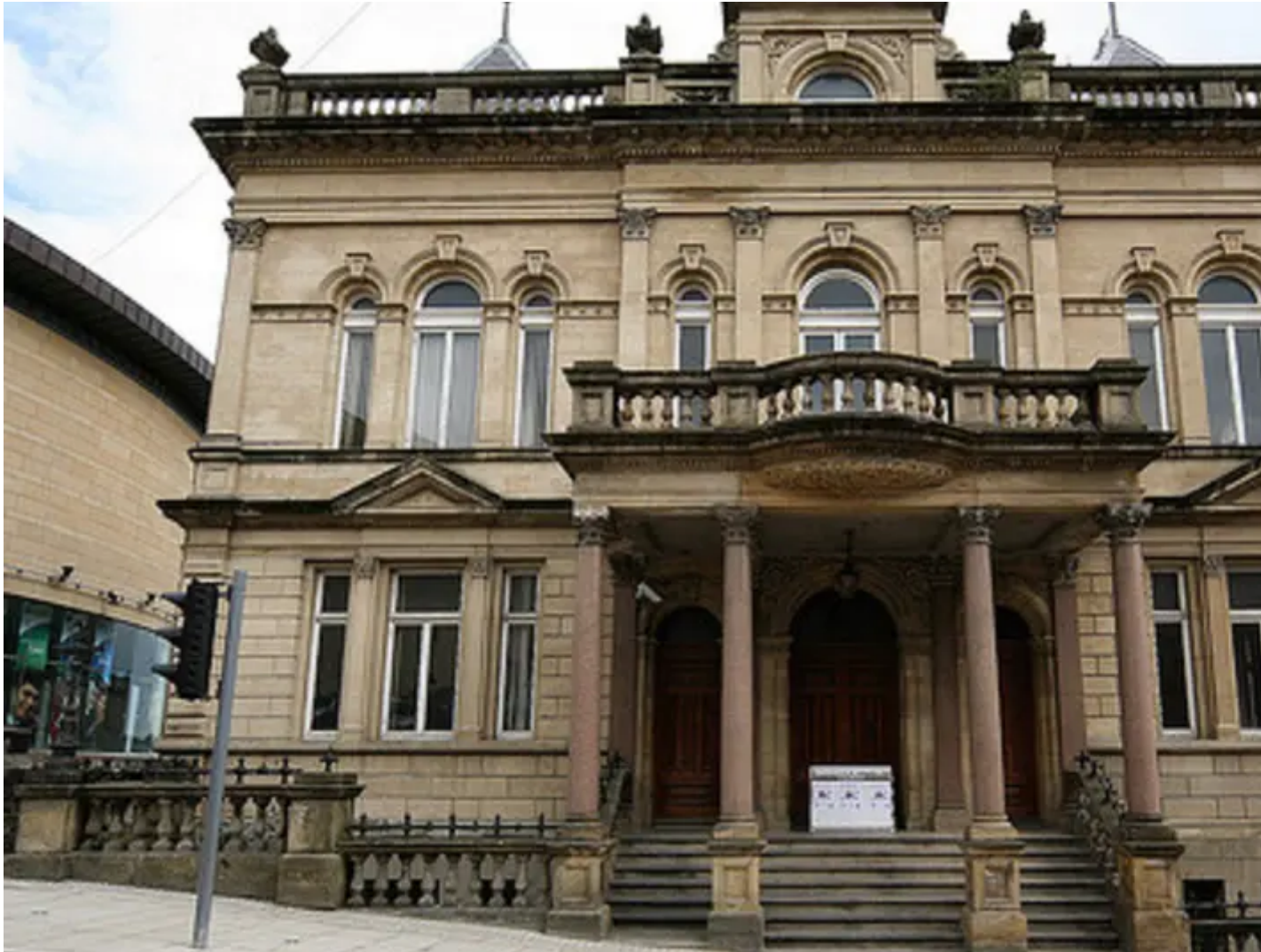
St Columb's Hall in Derry/Londonderry