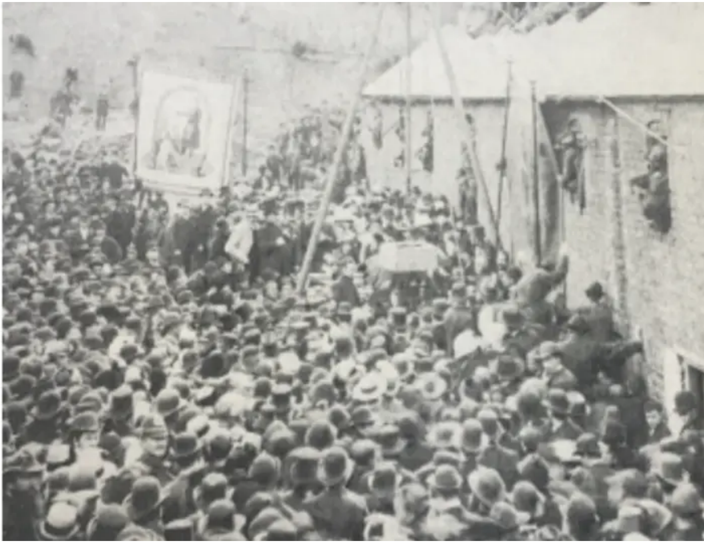
A large group gathers in 1886 as St Columb's Hall foundation stone is laid.