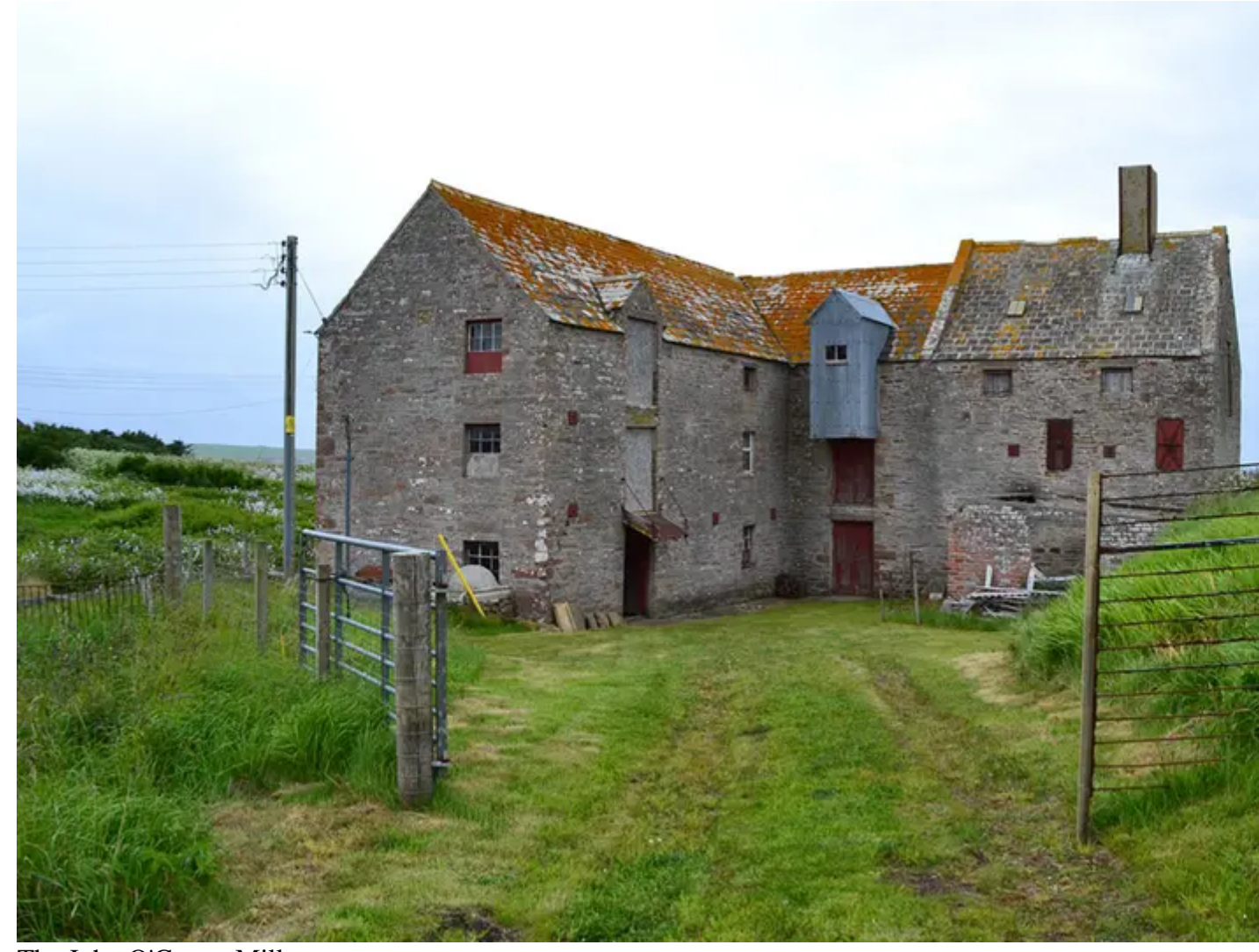
The John O'Groats Mill

The Trinity Centre in Cardiff received £892,000 for wide ranging improvements to the former Methodist church. The project will support the work of 24 different groups based there.