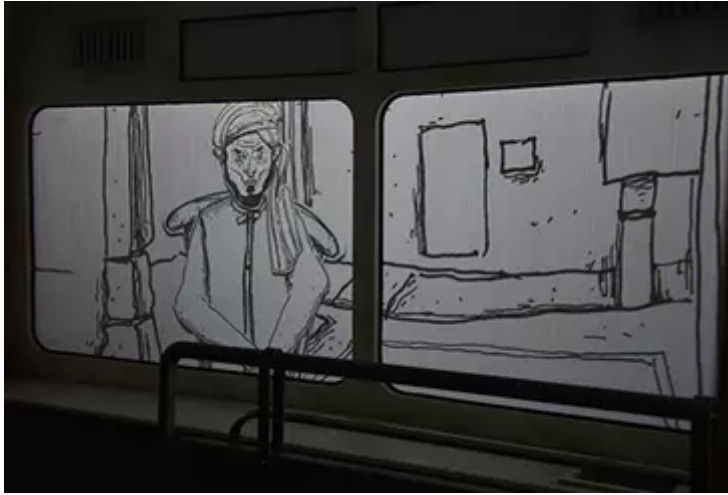
Bussing Out artwork.

The project used an exhibition and dance show to explore the stories of scrap metal collecting in Bradford. It included the tale of a young traveller girl from a 'rag-and-bone' family who makes musical instruments from materials she finds. Devised by young people, it will soon visit Bradford's libraries and community centres.