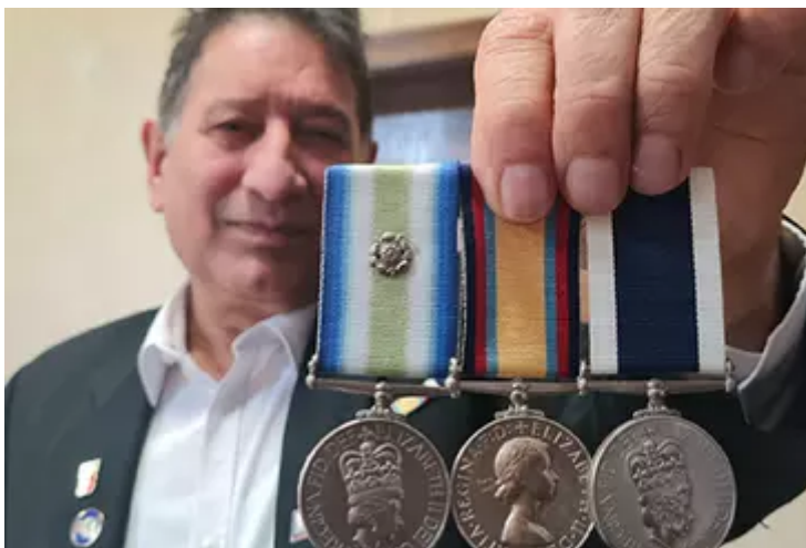
Commonwealth Contribution Memories.

Pupils from Bowling Park Primary School worked with a local author, illustrator and historian to create an immersive picture book telling the story of Bradford.