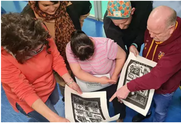
'Special' Histories of Bradford.