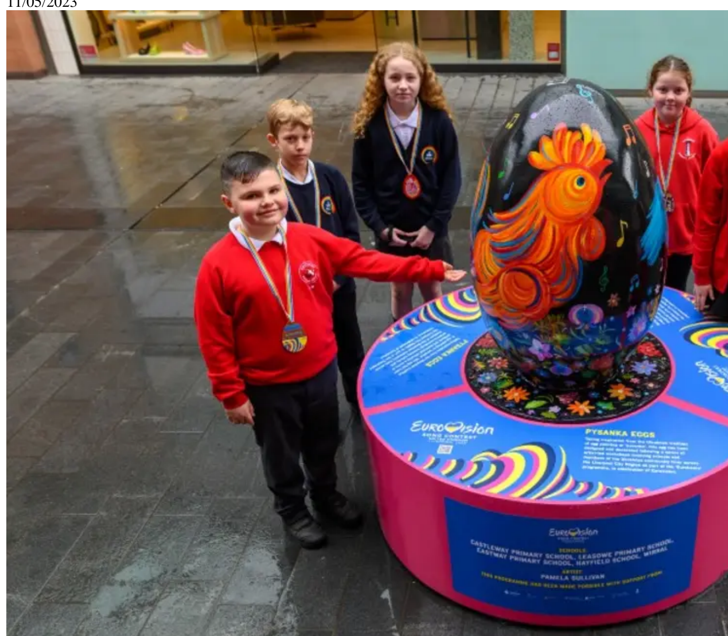
Children with the pysanka egg display for Eurovision. Thanks to £250,000 of National Lottery funding, we're supporting a host of activities as part of the Eurovision 2023 celebrations.

EuroFest is the cultural festival taking place alongside the song contest and features the community and education programmes known as EuroStreets and EuroLearn.