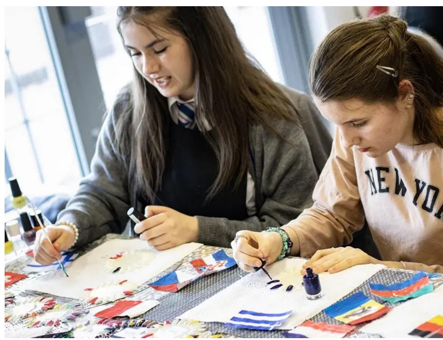
Eurovision-inspired nail art being created at a EuroStreets workshop in Runcorn.

As part of EuroStreets, 63 community groups and grassroots organisations were awarded a EuroGrant of up to £2,000 to put on activities and events to celebrate Eurovision and their heritage.