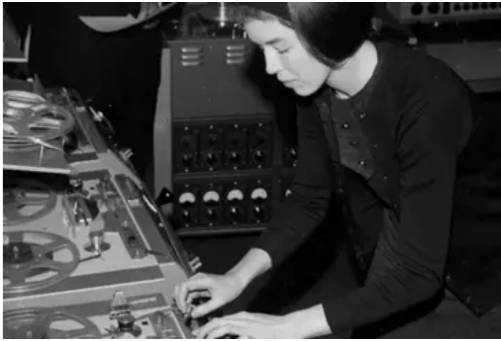
Delia Derbyshire working in the BBC Radiophonic Workshop.