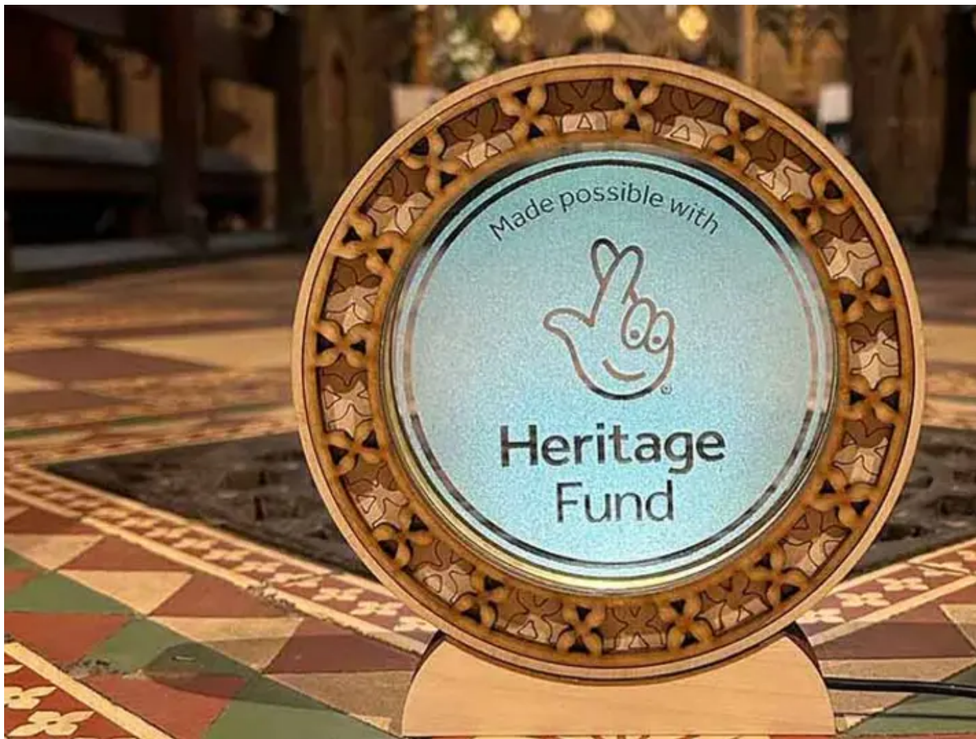
St Mary's Church, Shrewsbury's prizewinning acknowledgement plaque.

The judges were blown away by the creativity shown in St Mary's Church, Shrewsbury's entry to the competition. Designed to match the historic Grade I listed building, the acknowledgement stamp has been laser-etched onto glass and fitted into a birch ply laser-cut frame.