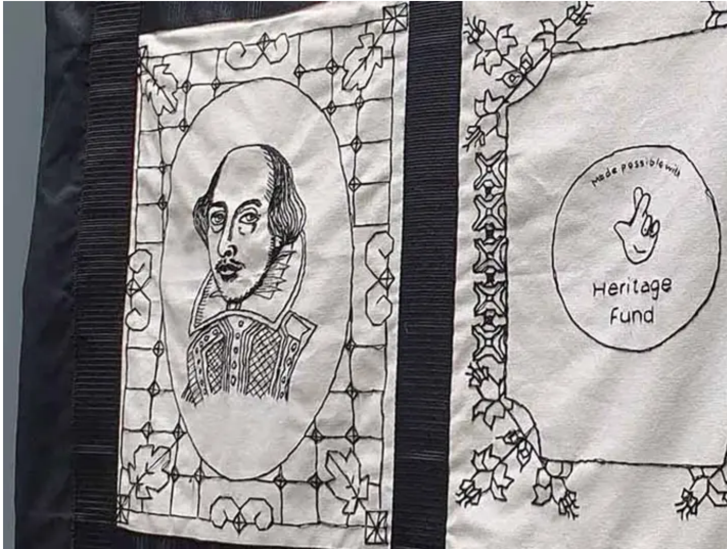
Shakespeare North Playhouse's intricately embroidered acknowledgement.

Our acknowledgement stamp was reproduced in Elizabethan blackwork embroidery and displayed as part of a larger 10m tapestry at the Shakespeare North Playhouse. The tapestry was developed as part of a project which enabled 45 Community Curators to undertake 900 hours of research into Knowsley's connection to Shakespeare.