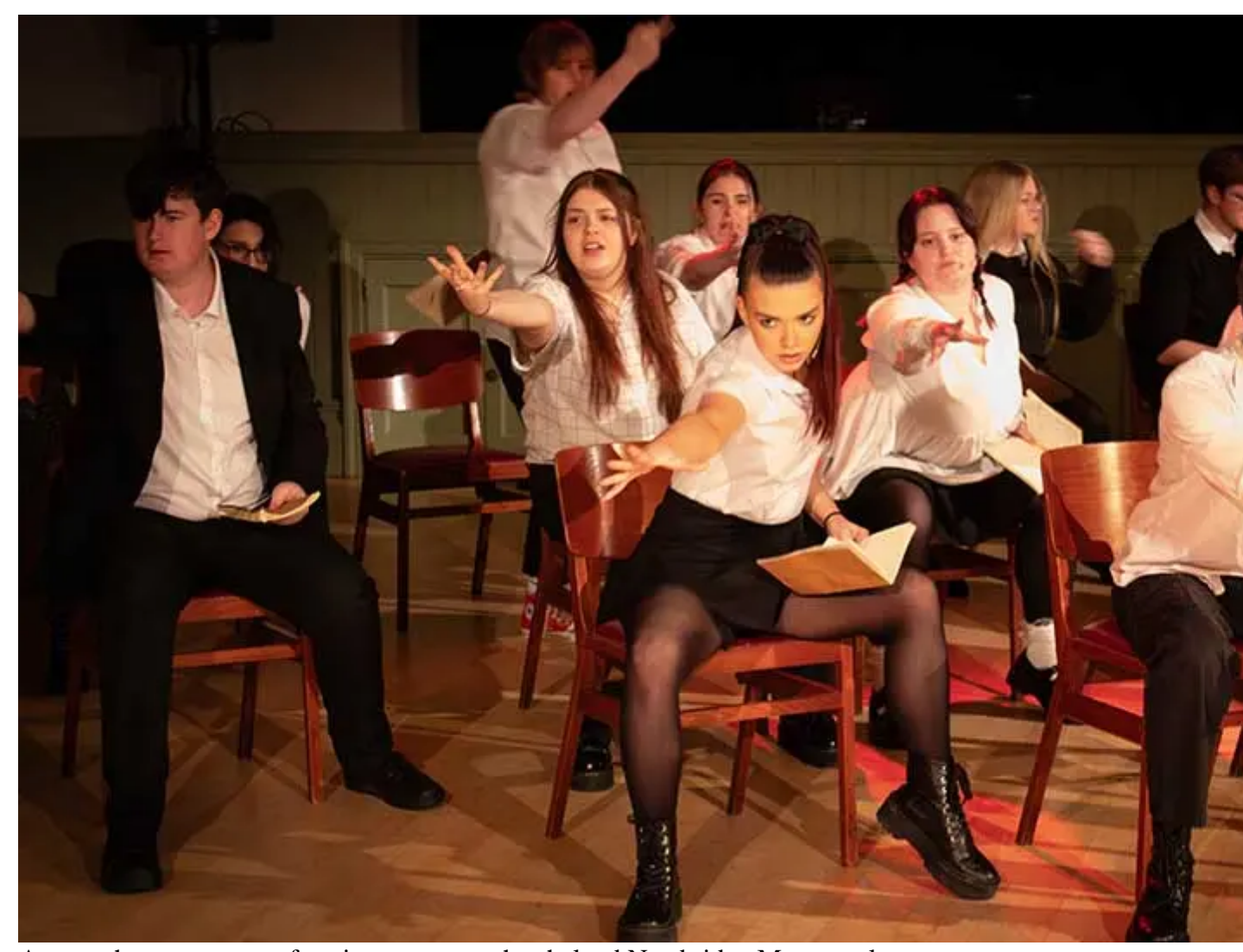
A pay-what-you-can performing arts group has helped Newbridge Memo welcome more children and young people into the building.

Newbridge Memo's The Way Forward project is safeguarding the future of the historic miners' institute. After a review of the organisation's governance and discussions with the local community about what they wanted from the space, the venue developed new business, marketing and fundraising strategies and a revamped programme of events.