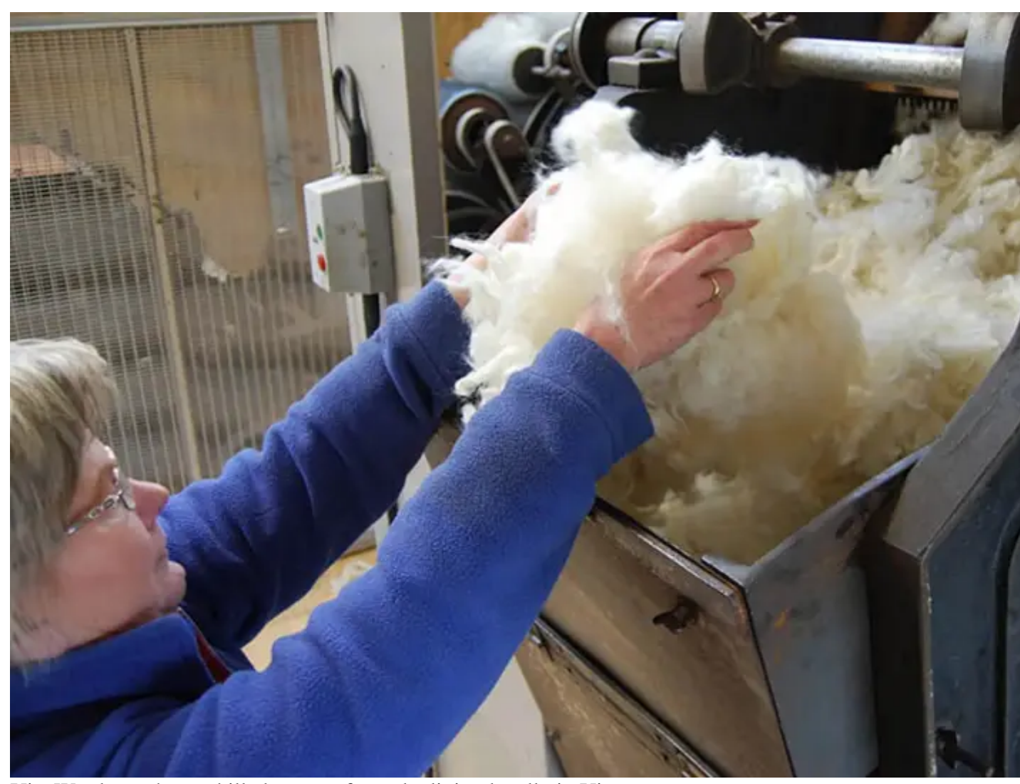
Uist Wool now has a skilled group of people, living locally in Uist.

Alongside repairing Uist Wool Mill's historic machinery, <u>Calanas – transforming textile traditions</u> has developed traineeships in wool spinning and mill engineering. The placements are creating viable long-term employment opportunities on the islands and supporting the sustainability of the industrial heritage sector.