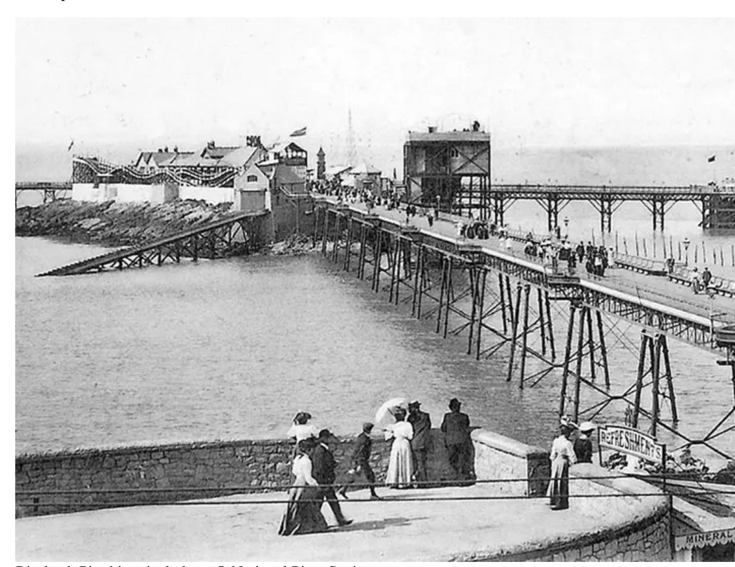
Birnbeck Pier historical photo © National Piers Society.

The lack of maintenance during private ownership caused the pier to become unsafe and in 1994 it was closed to the public.