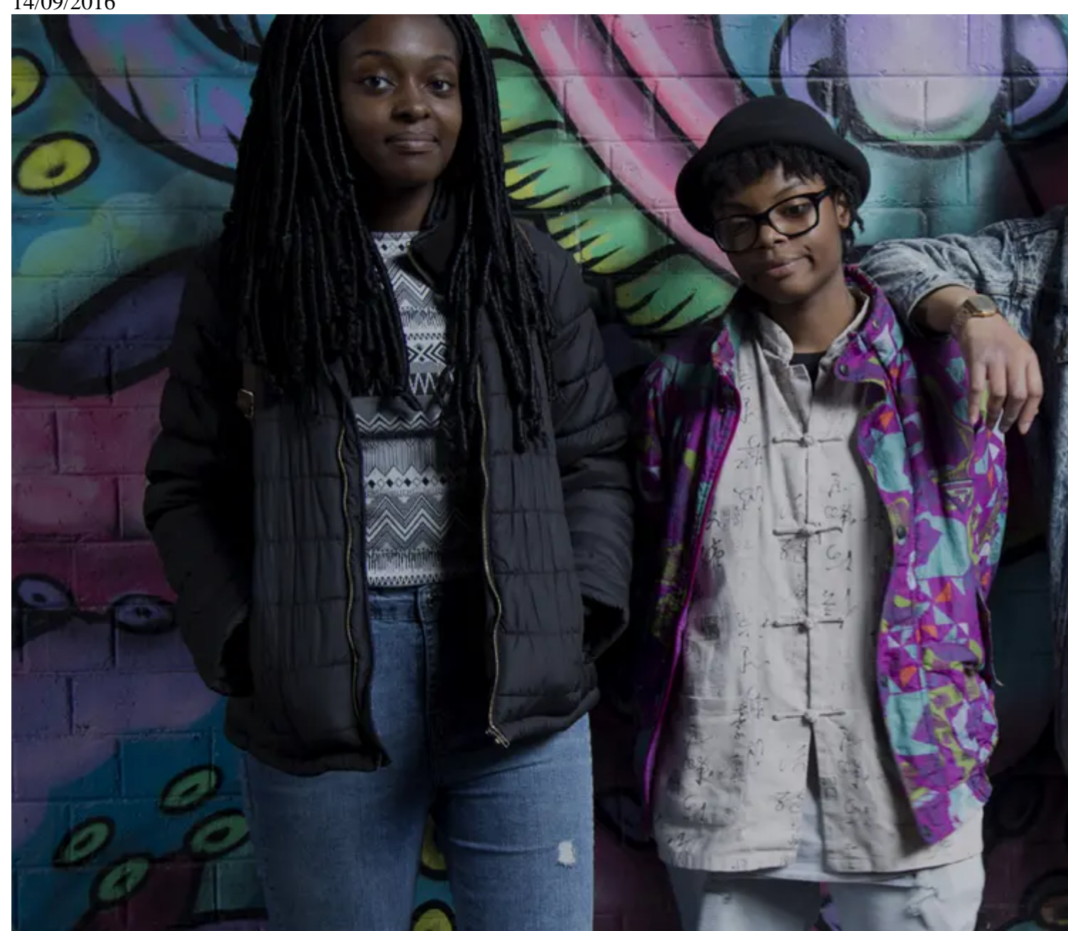
Young creative minds from Birmingham's HLF-supported Routes2Roots campaign reveal what heritage means to them - and how the project has inspired them.

Ten young people volunteered their time and passion in co-creator roles throughout the campaign, ranging from creative director to social media expert.