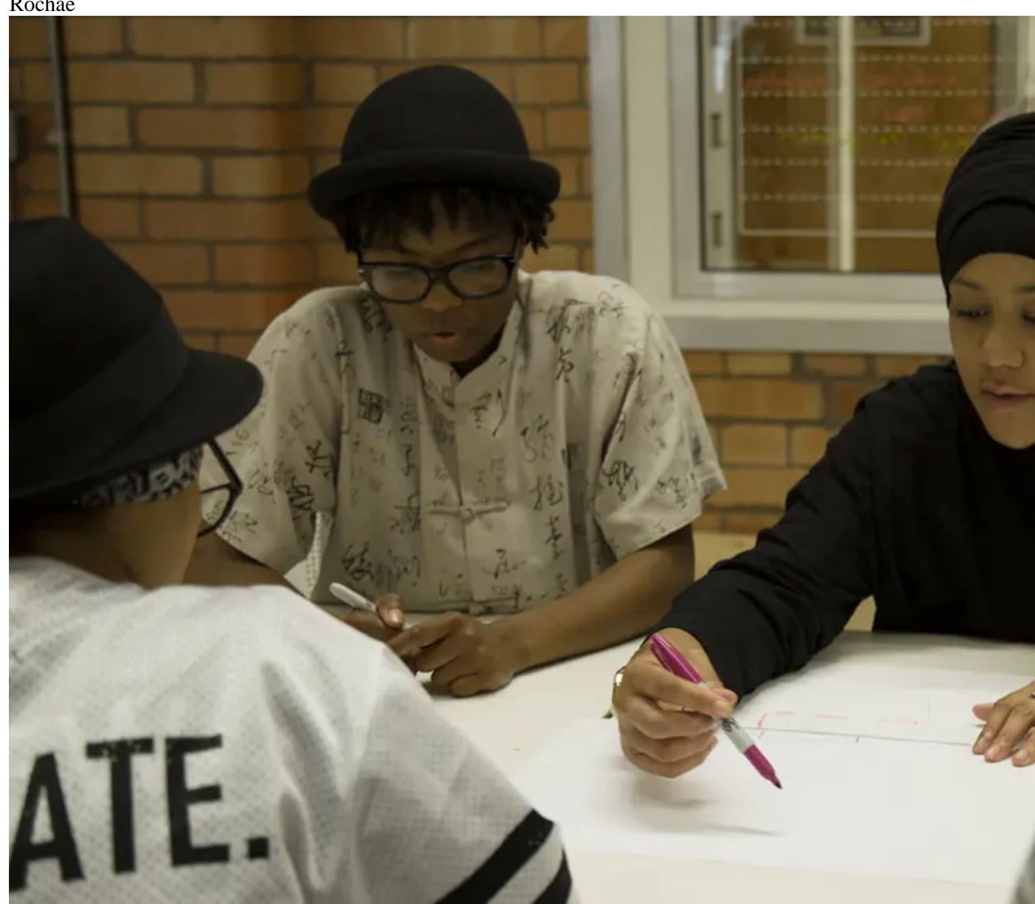
Efall diddordeb hefyd mewn ...