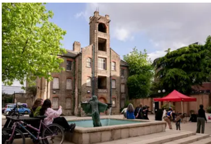
Alice Billings House, Stratford

Seven more organisations have been awarded development funding to finalise plans for creating community hubs for engagement, education, creativity and wellbeing: