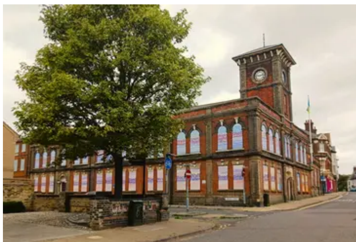
Lowestoft Town Hall, Suffolk

This 'at risk' building is set to become a thriving, sustainable Gateway Community Hub. The project, which will also receive £1m from the future High Streets Fund via Medway Council, will revitalise heritage in Chatham for generations to come.