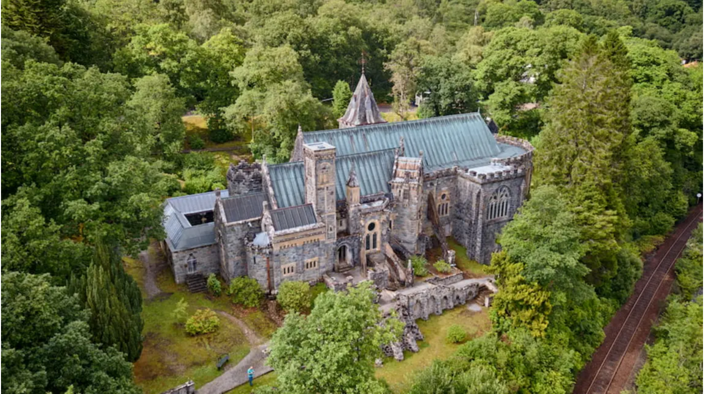
St. Conan's Kirk, Argyll, Scotland

From the only thatched ice house of its kind to the oldest picture house in Northern Ireland, we have awarded 12 heritage buildings life-saving support.