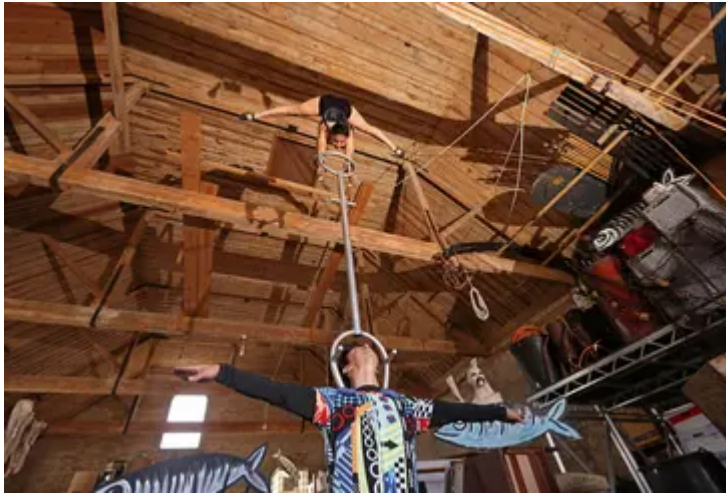
Duo Vita Circus perform at the Ice House in Great Yarmouth