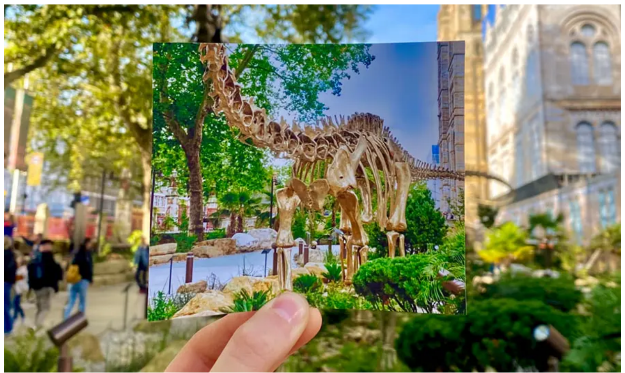
Fern the Diplodocus is unveiled in the new garden at The Natural History Museum, London, in 2024