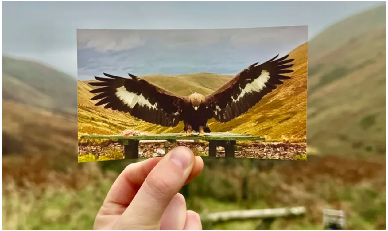
Golden eagles are reintroduced in Dumfries, Galloway and the Scottish Borders, in 2018

The Remembrance art installation 'Poppies: Wave and Weeping Window'