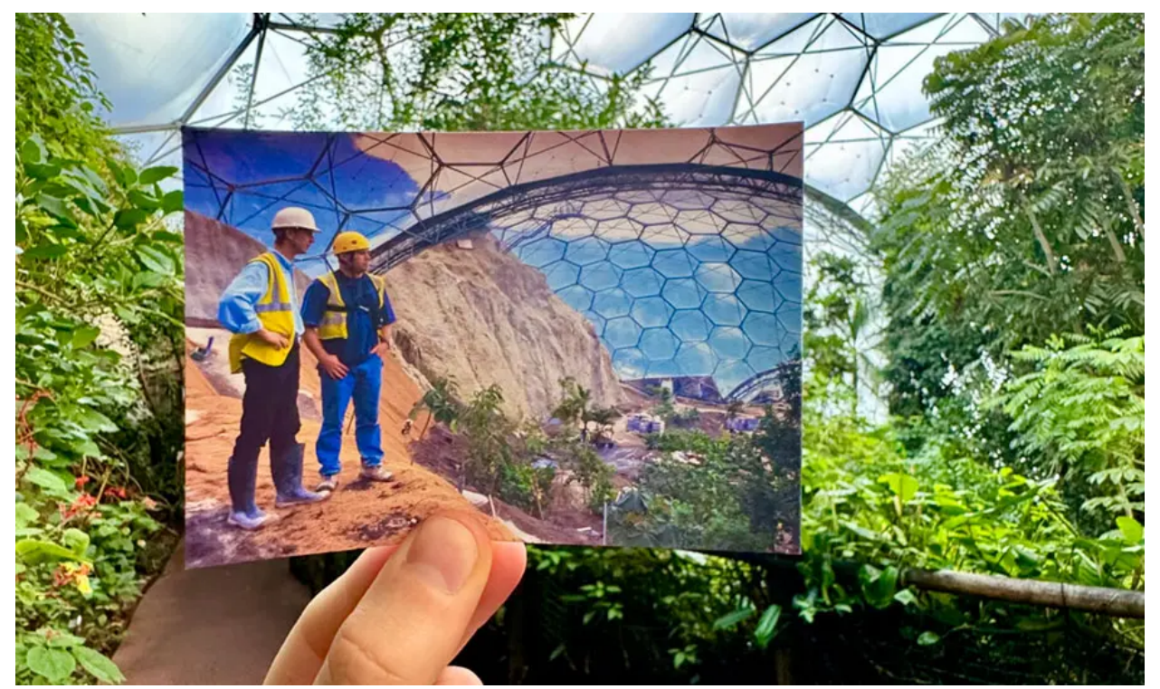
The Eden Project – a series of giant conservatories built in a disused clay pit – opens in Cornwall, in 2001