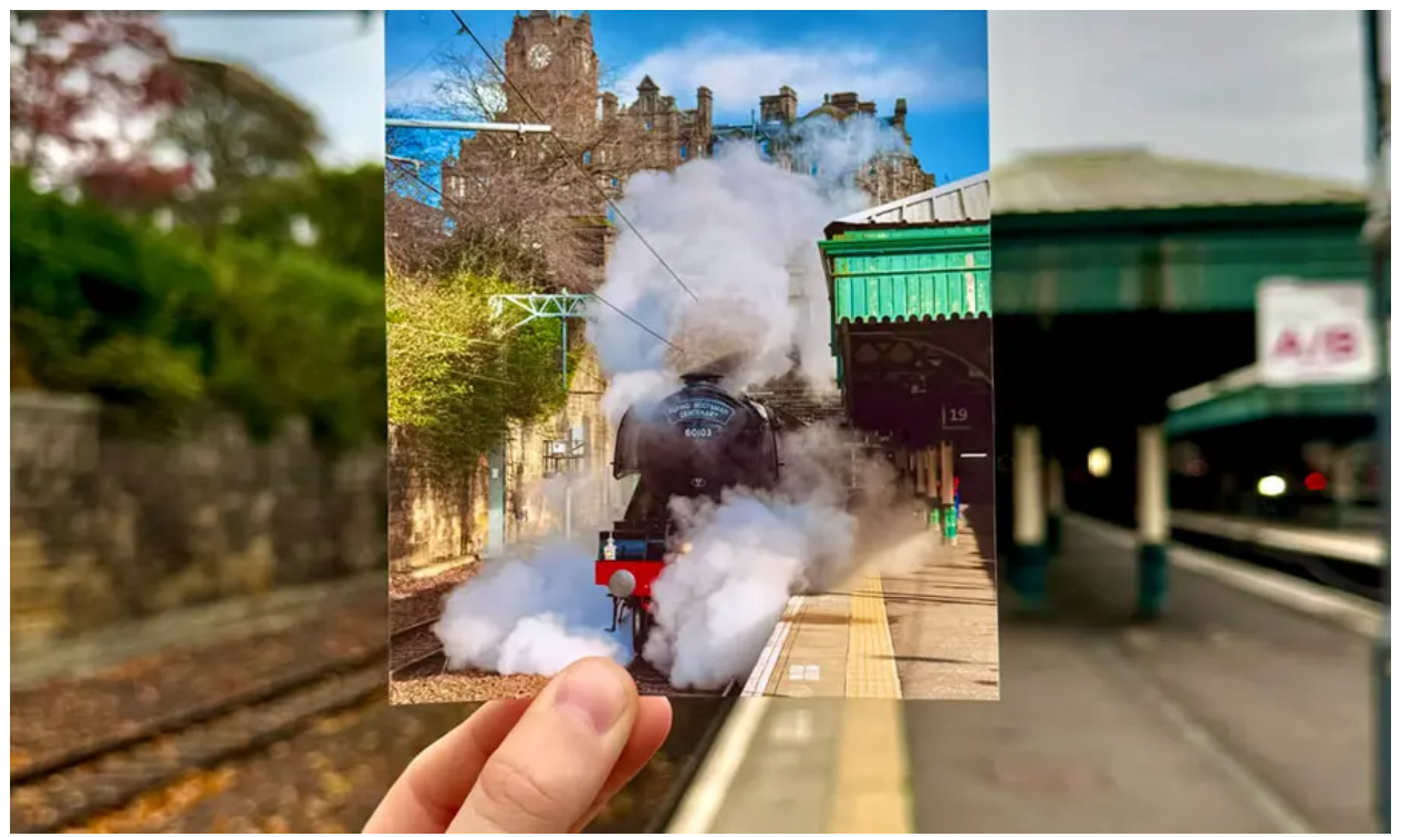
The Flying Scotsman steams again , kicking off its centenary celebrations in Edinburgh, in 2023