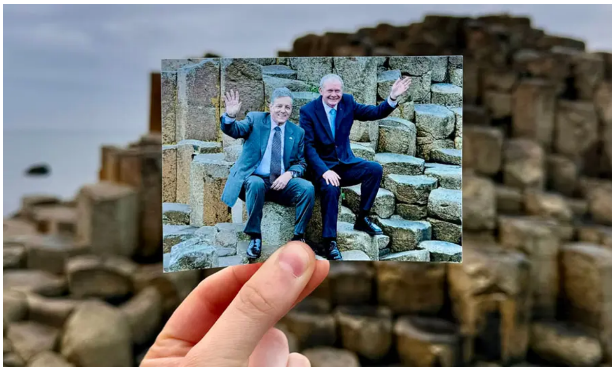
The Giant's Causeway Visitor Centre in County Antrim is opened by First Minister Peter Robinson and Deputy First Minister Martin McGuinness, in 2012