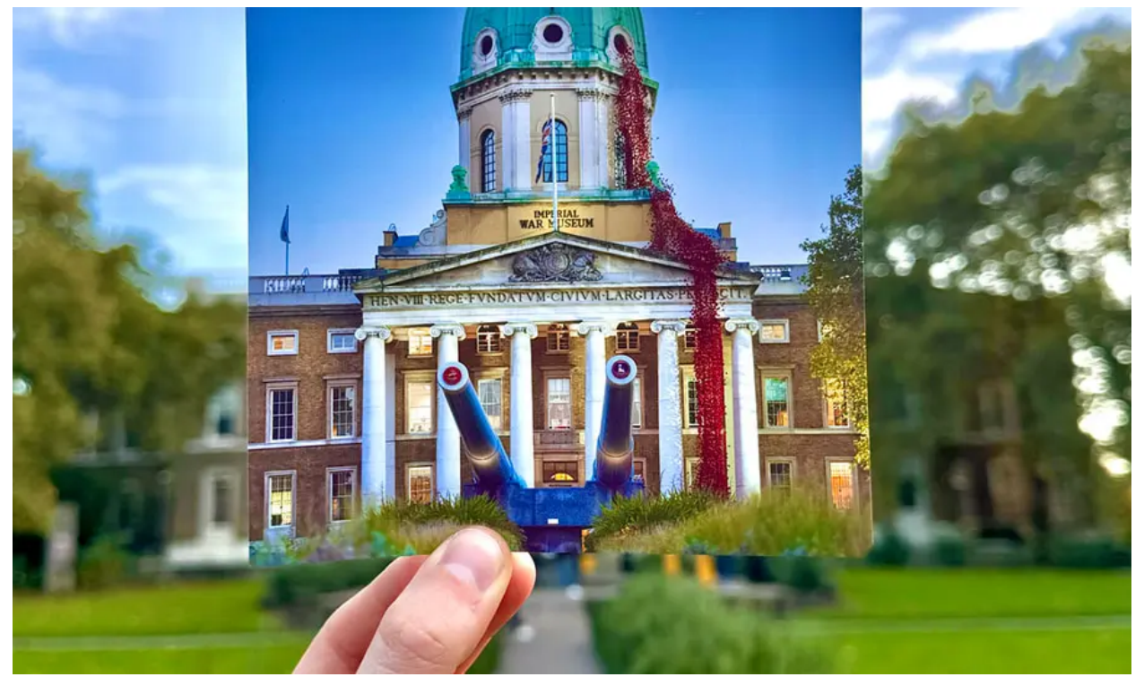
The Remembrance art installation 'Poppies: Wave and Weeping Window' is displayed at the Imperial War Museum, London in 2018