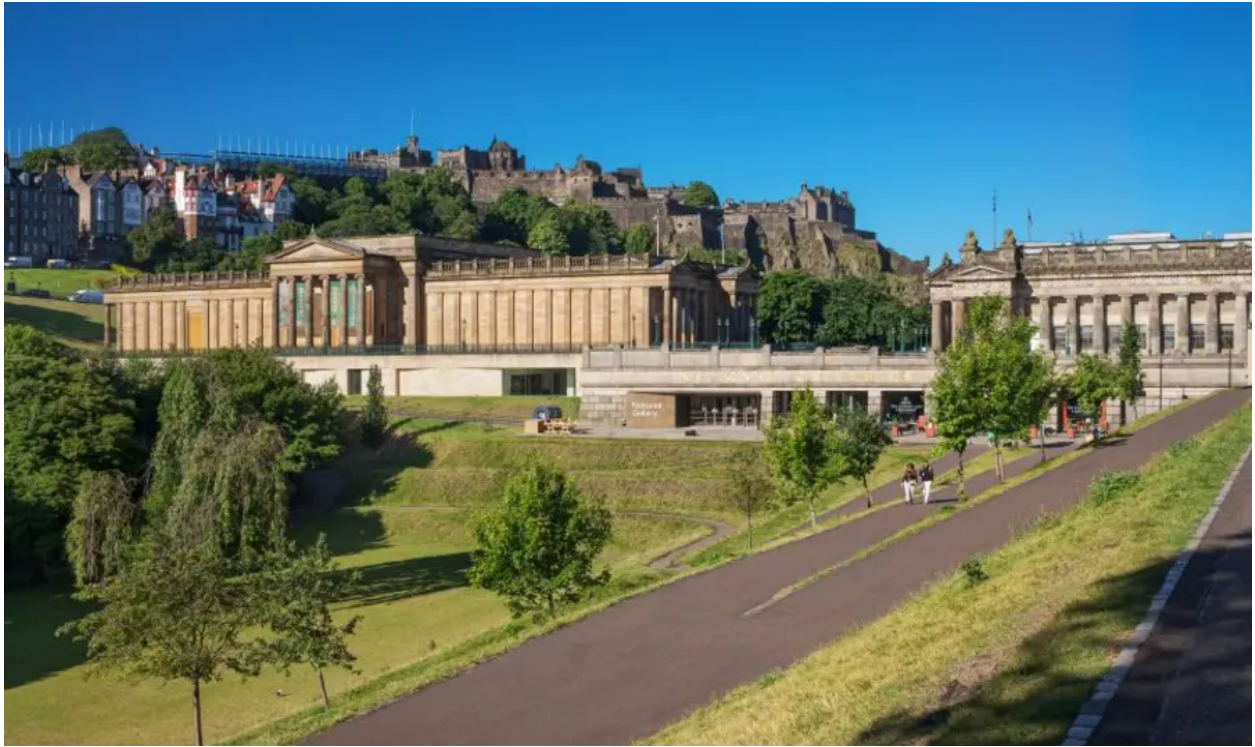
The National in Edinburgh, as seen from Princes Street Gardens.

The project was completed in late summer 2023. It reintroduced visitors to the historic Scottish art collection, which had languished for years in dark, outmoded galleries with poor access.