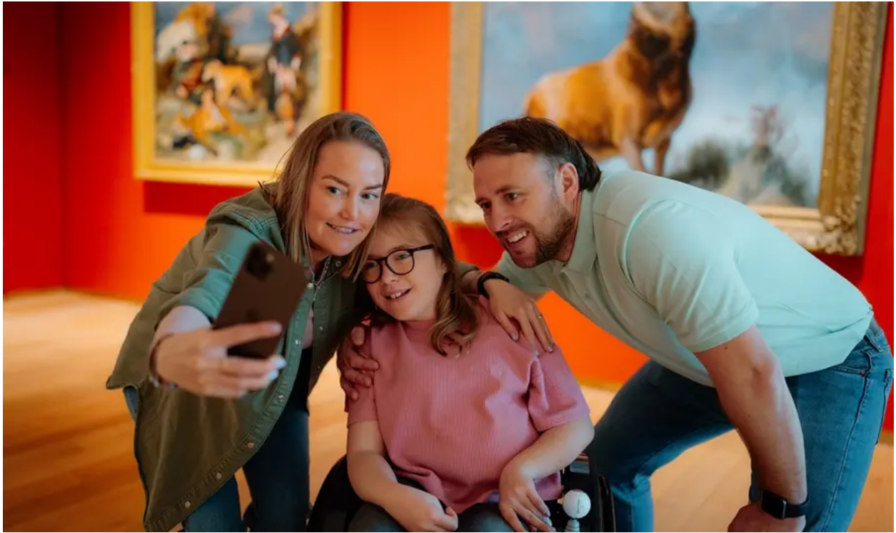
Visitors to the Scottish galleries pose for a selfie with Monarch of the Glen.