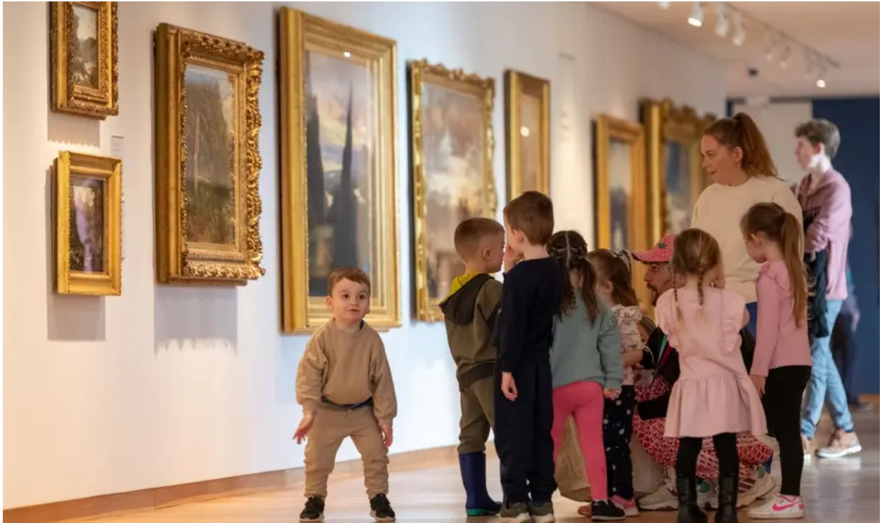
A nursery group visit the Scottish galleries for a learning session.